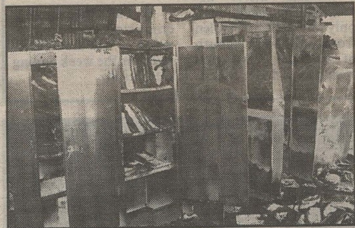
The remains of the library that contained more than 2000 technical manuals and reference books.